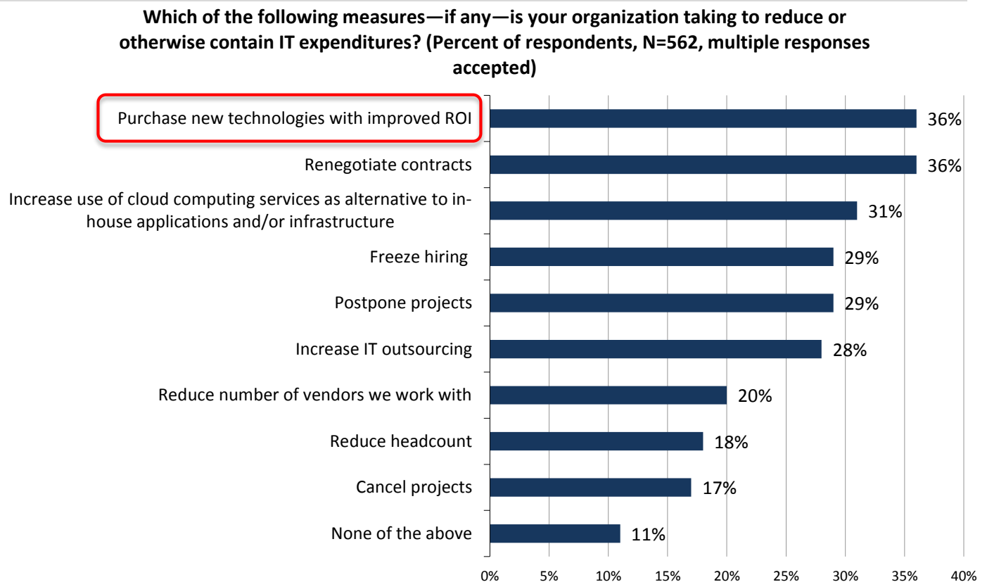
Figure 1. Cost-containment Measures

Source: Enterprise Strategy Group, 2014.